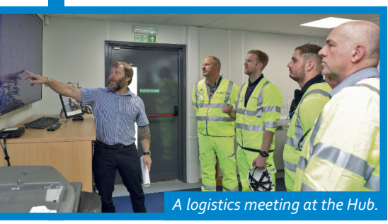
A logistics meeting at the Hub.