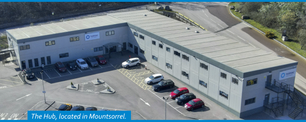
The Hub, located in Mountsorrel.