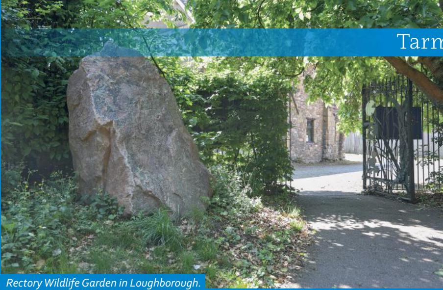
Rectory Wildlife Garden in Loughborough.