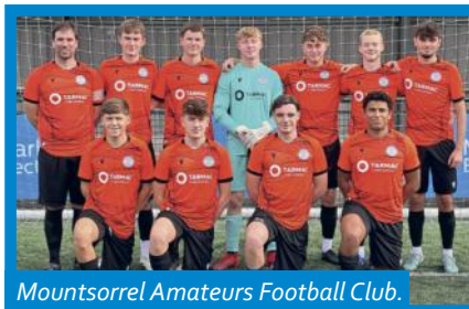
Mountsorrel Amateurs Football Club.