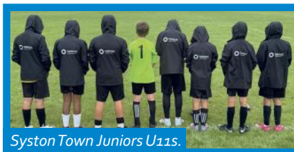
Syston Town Juniors U11s.

team, helping them look the part on the pitch as they continue to represent the village in local leagues.