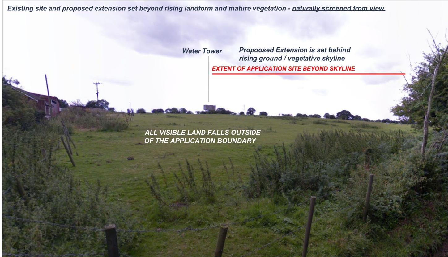
PHOTO VIEWPOINT A - EXISTING VIEW FROM FRETtenham ROAD