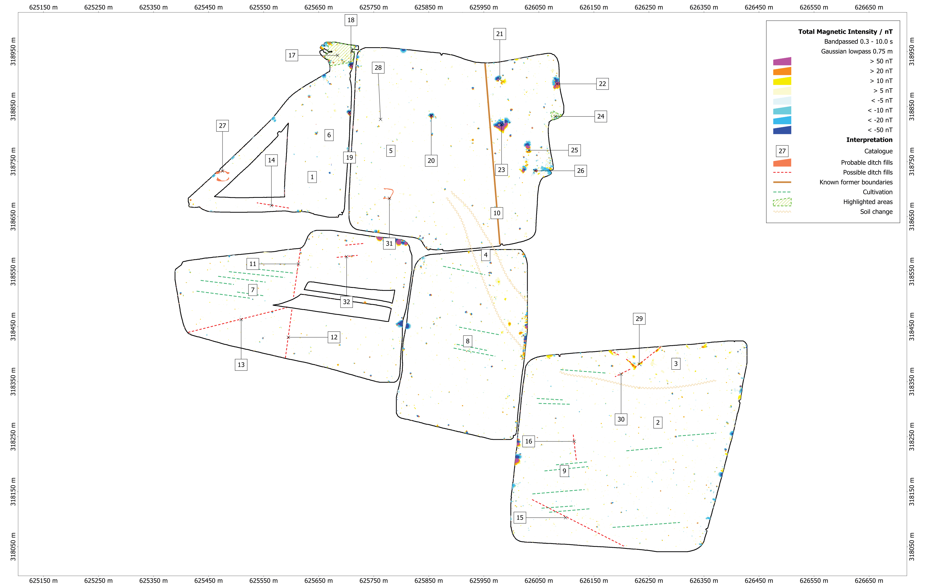
SQH201 Stanninghall Quarry, Horstead, Norfolk DWG 04 Interpretation - Vector only

Orthographic Scale: 1:4000 @ A3 Spatial Units: Meter. Do not scale off this drawing File: tg_SQH201.map Copyright TigerGeo Limited 2020